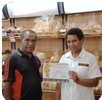
Grace Kunai Best Buy