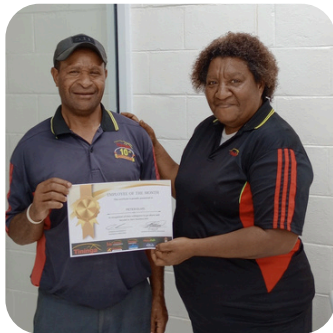
Peter Elvis Town Hardware