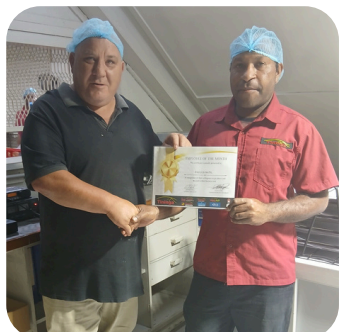
Paulus Natil Highlands Bakery